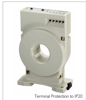
Terminal Protection to IP20